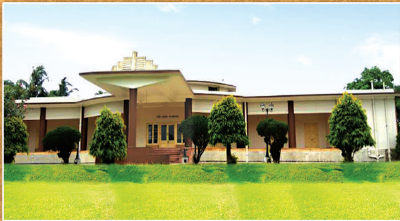
Gandhi Memorial Museum, Barrackpore